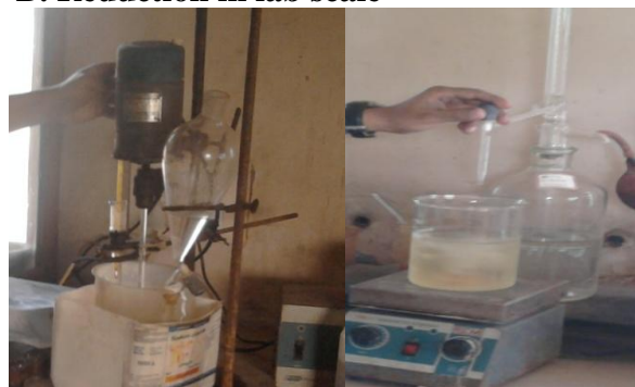
Fig 2 Reduction set up