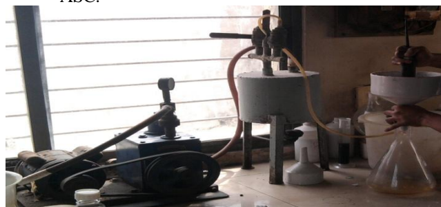
Fig 1 Experimental set up of Vacuum Filtration